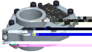
■ SHORTCUTT® 500 2-inch Valve