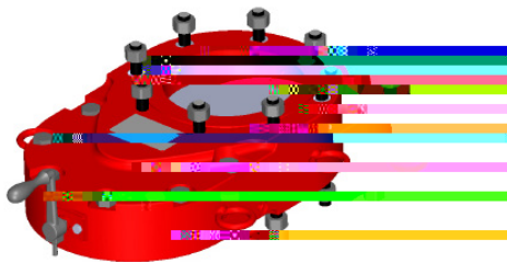
■ SHORTCUTT® 8-inch Valve